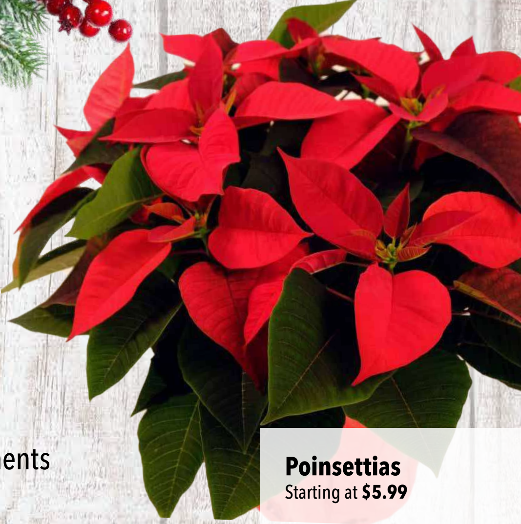
Poinsettias Starting at $5.99

We offer a stunning variety of plants and florals that bring seasonal delight to your home. From gorgeous arrangements and high-quality bouquets, to festive potted plants, we have everything you need to add some holiday spirit to your indoor and outdoor décor at excellent value!