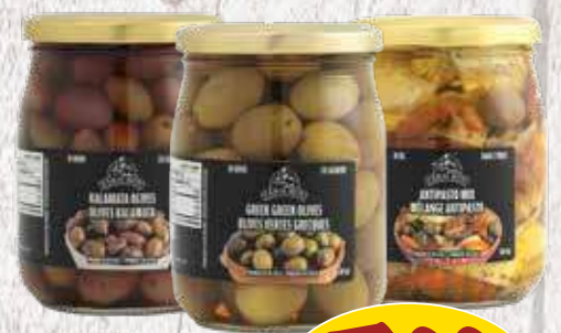
Farm Boy™ Gourmet Olives & Antipasti all varieties, 580 mL