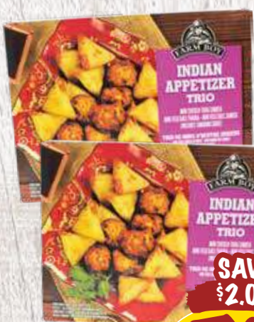
Farm Boy™ Indian Appetizer Trio 410 g