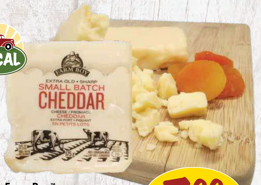
Farm Boy™ Extra Old Sharp Small Batch Cheddar 175 g