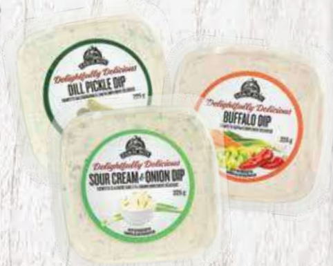
Farm Boy™ Delightfully Delicious Dips all varieties, 225 g