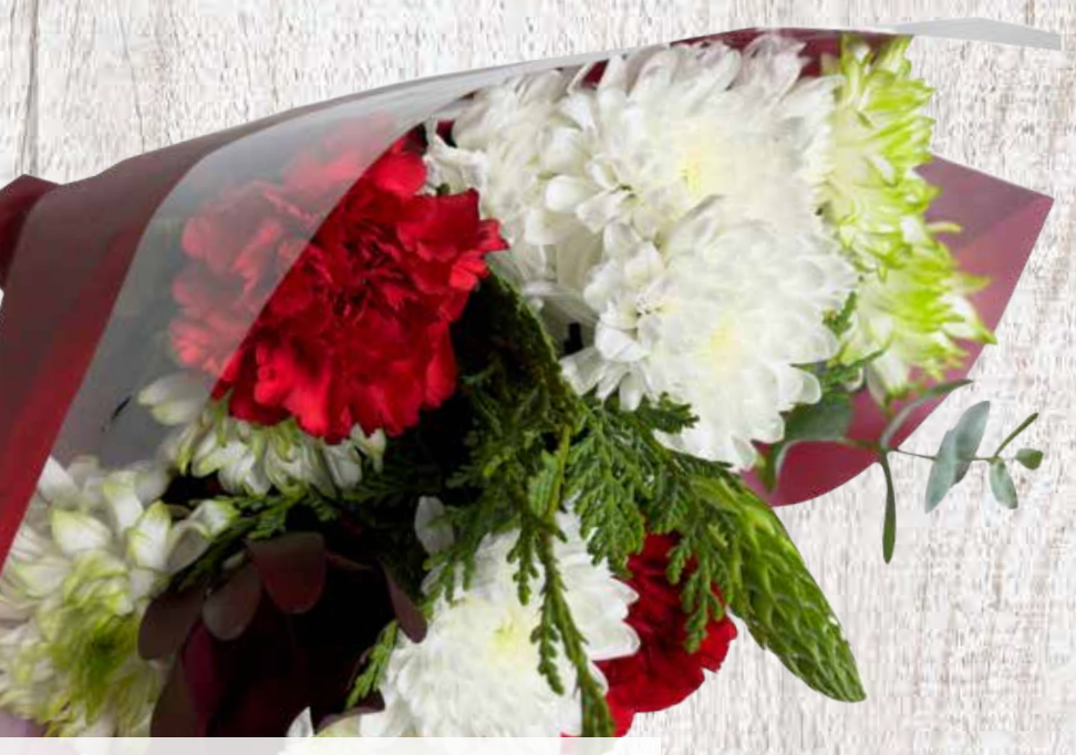
Farm Boy™ Holiday Bouquets Starting at $14.99