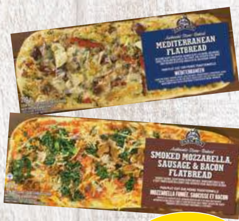
Farm Boy™ Artisan Stone-Baked Flatbreads all varieties, 390-430 g