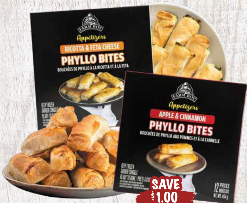
Farm Boy™ Phyllo Bites all varieties, 454 g