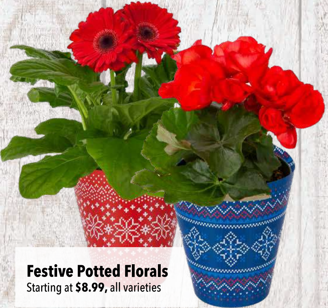
Festive Potted Florals Starting at $8.99, all varieties