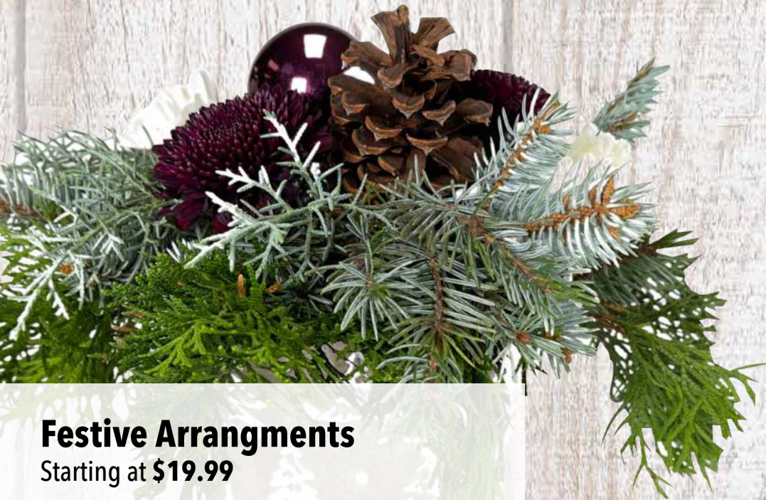
Festive Arrangments Starting at $19.99