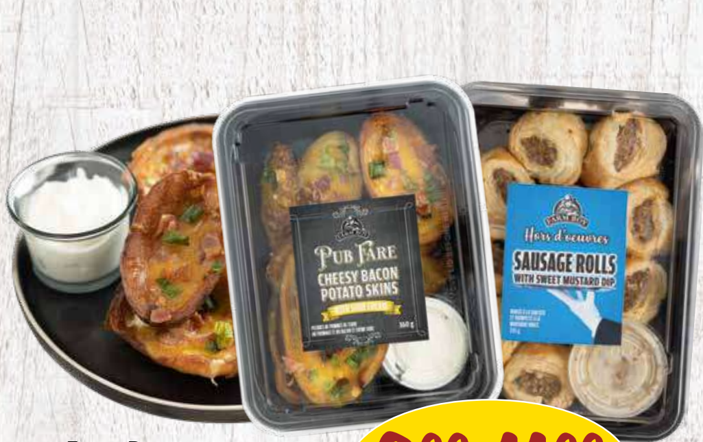
Farm Boy™ Heat & Serve Hors d'oeuvres all varieties, 225-575 g

If you're looking for a little assistance in the food department this holiday season, look no further! Discover a delicious variety of chef-prepared dishes, fresh dips, heat-and-serve appetizers, and more at all of our stores. These convenient options will help you prepare a well-rounded feast that you and your guests will love.