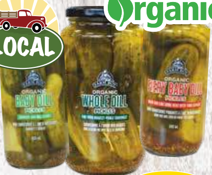
Farm Boy™ Organic Pickles all varieties, 500 mL-1 L