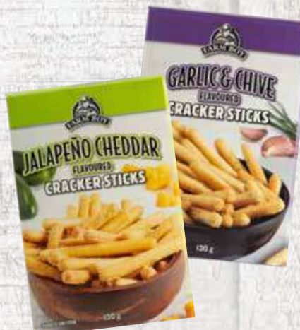
Farm Boy™ Cracker Sticks all varieties, 130 g