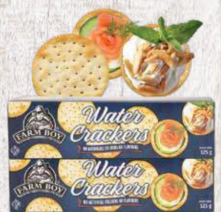
Farm Boy™ Water Crackers 125 g