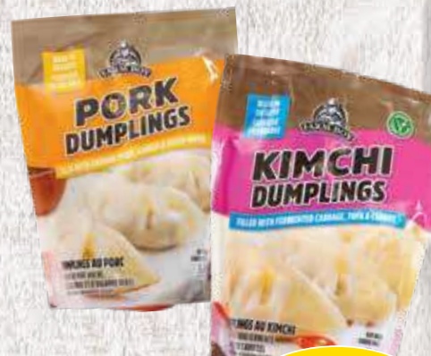
Farm Boy™ Dumplings all varieties, 500 g