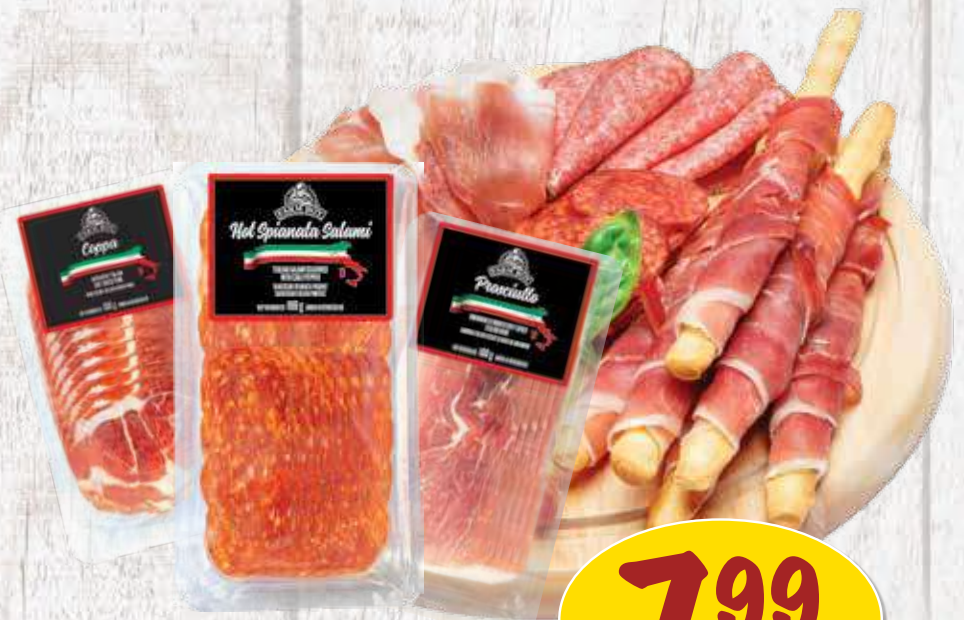
Farm Boy™ Italian Deli Meats select varieties, 100 g