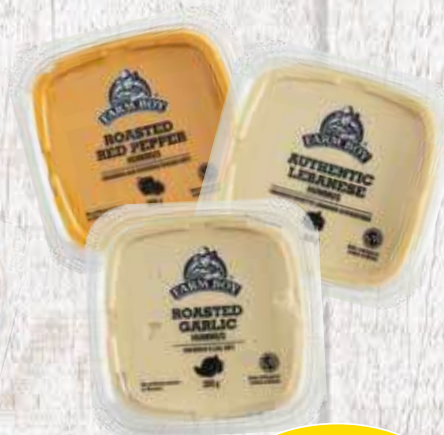
Farm Boy™ Homestyle Hummus all varieties, 300 g