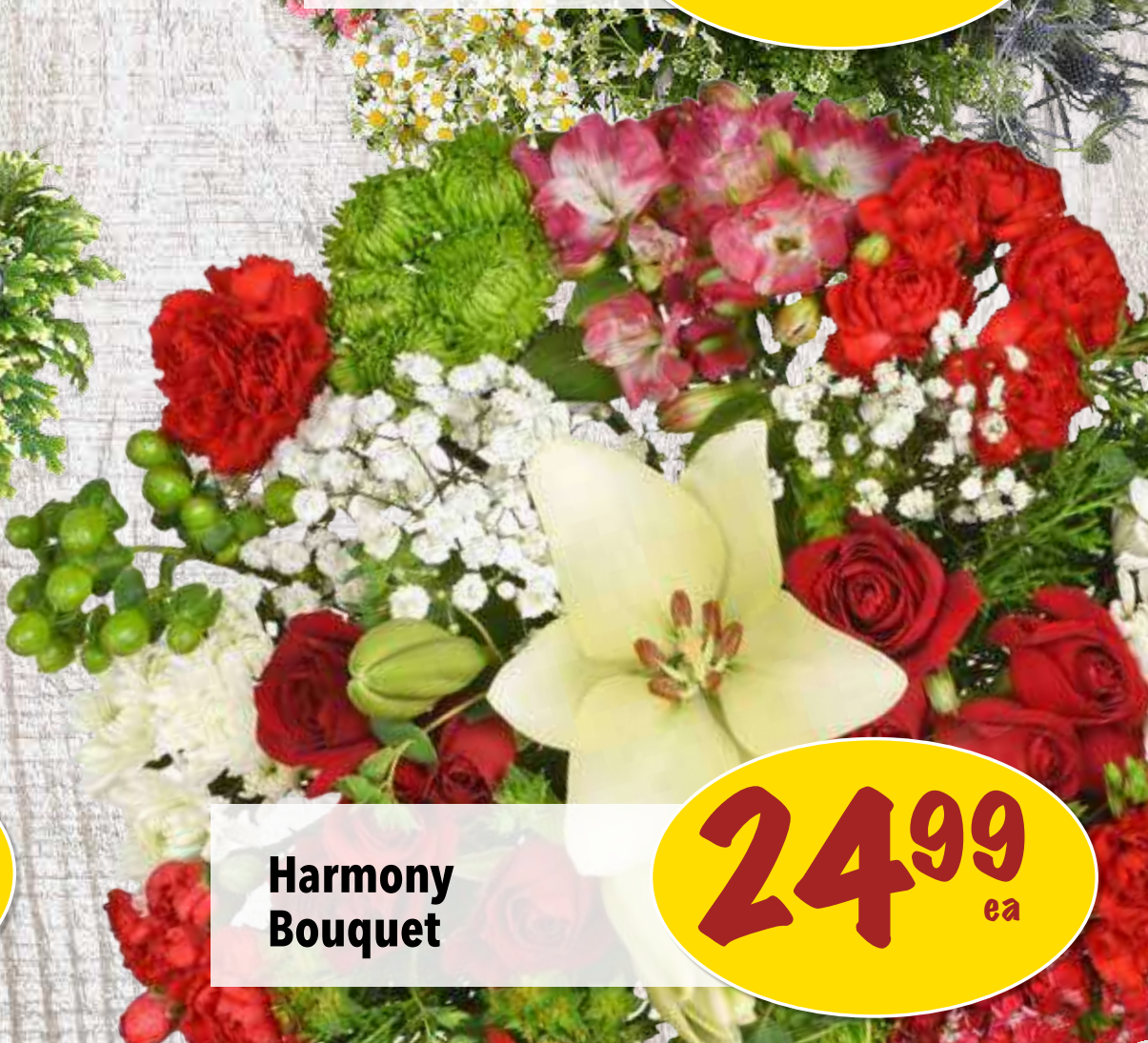
Harmony Bouquet 24 99 ea