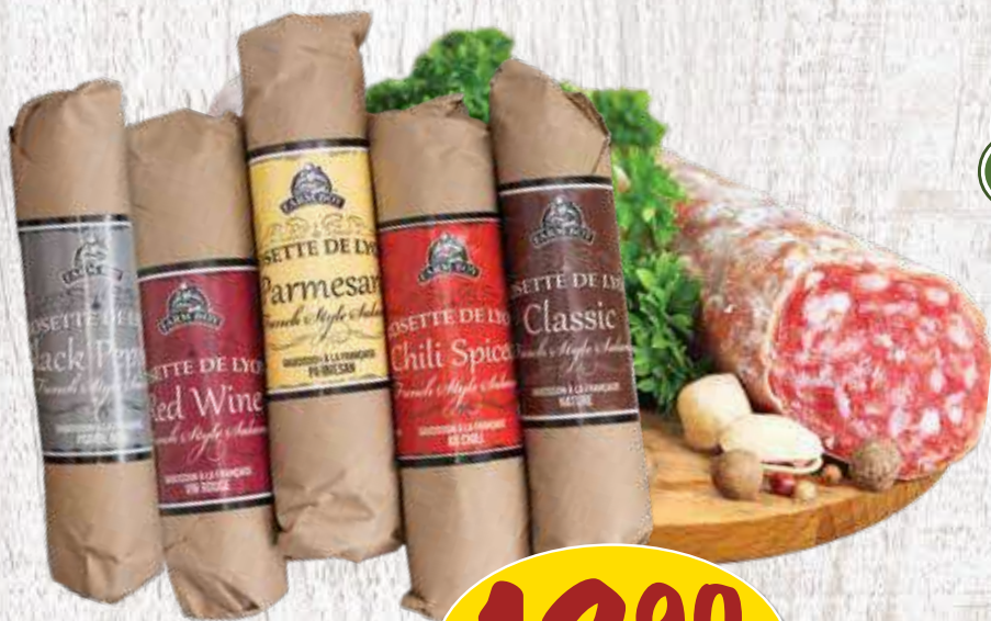
Farm Boy™ Rosette De Lyon all varieties, 300 g