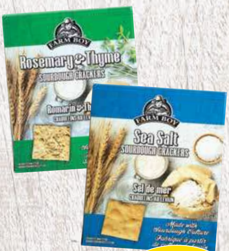
Farm Boy™ Sourdough Crackers all varieties, 150 g