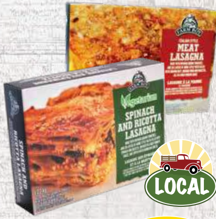
Farm Boy™ Homestyle Lasagna all varieties, 1.22 kg