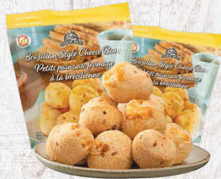
Farm Boy™ Brazilian-Style Cheese Buns 360 g