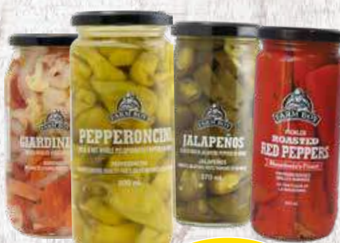
Farm Boy™ Pickled Vegetables select varieties, 250 mL-720 mL