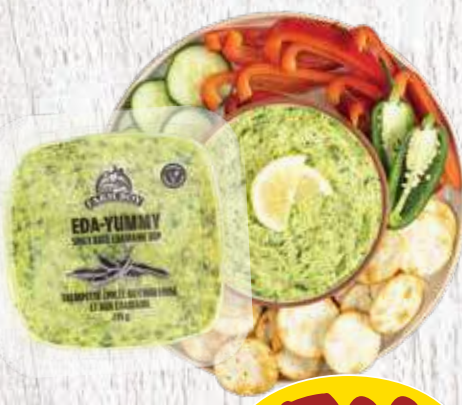
Farm Boy™ Eda-Yummy Spicy Kale Edamame Dip 275 g