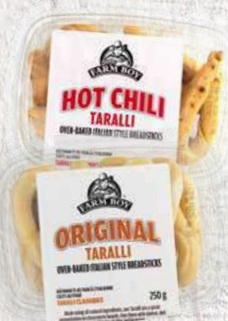
Farm Boy™ Taralli all varieties, 250 g