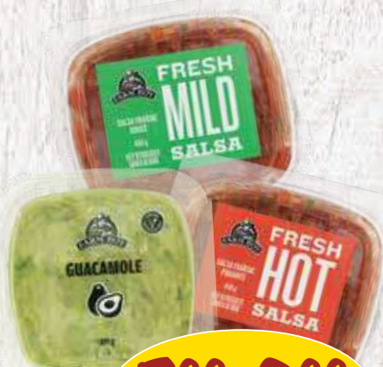
Farm Boy™ Fresh Guacamole or Salsa all varieties, Guacamole: $6.99, 275 g, Salsa: $5.99, 450 g