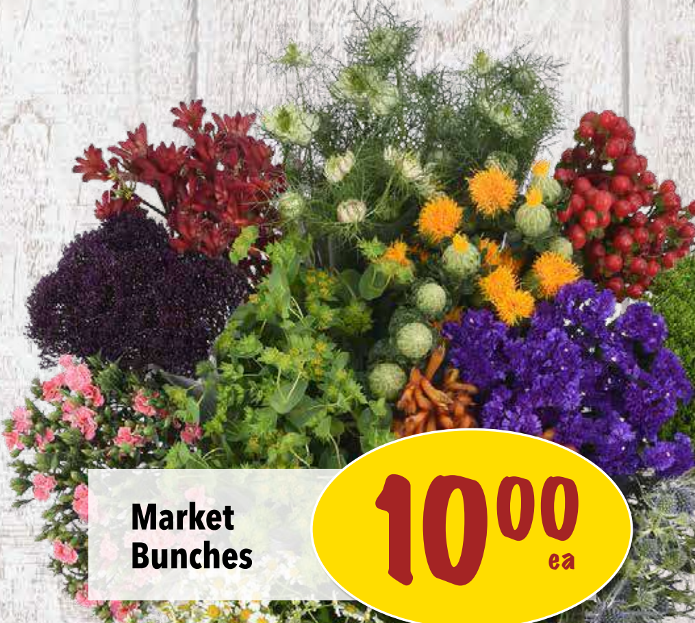
Market Bunches 10 00 ea