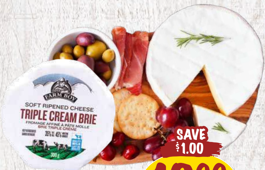
Farm Boy™ Triple Cream Brie product of Canada, 300 g

From artisanal cheeses and authentically crafted Italian deli meats to antipasto favourites and crunchy dippers, fill your table with tasty Farm Boy finds! Arrange an unforgettable charcuterie platter, load up your antipasto bar, or create an amazing fondue station. The possibilities are endless with our wide selection of expertly curated products.