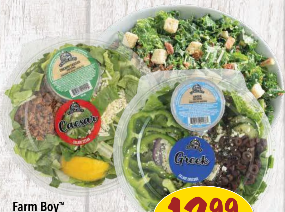
Farm Boy™ Family Sized Salads all varieties, dressing included, 450-600 g