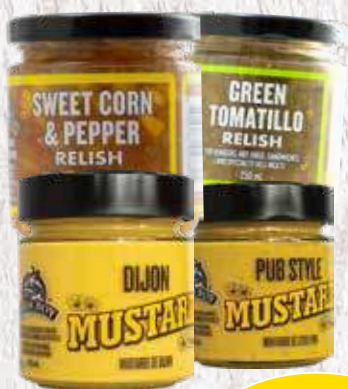
Farm Boy™ Gourmet Mustard & Relish all varieties, 225-250 mL