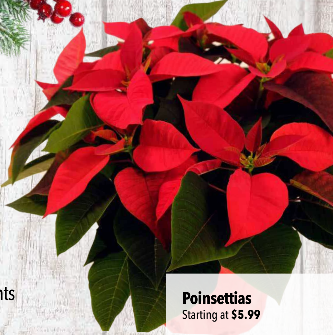
Poinsettias Starting at $5.99

We offer a stunning variety of plants and florals that bring seasonal delight to your home. From gorgeous arrangements and high-quality bouquets to festive potted plants, we have everything you need to add some holiday spirit to your indoor and outdoor décor at an excellent value!