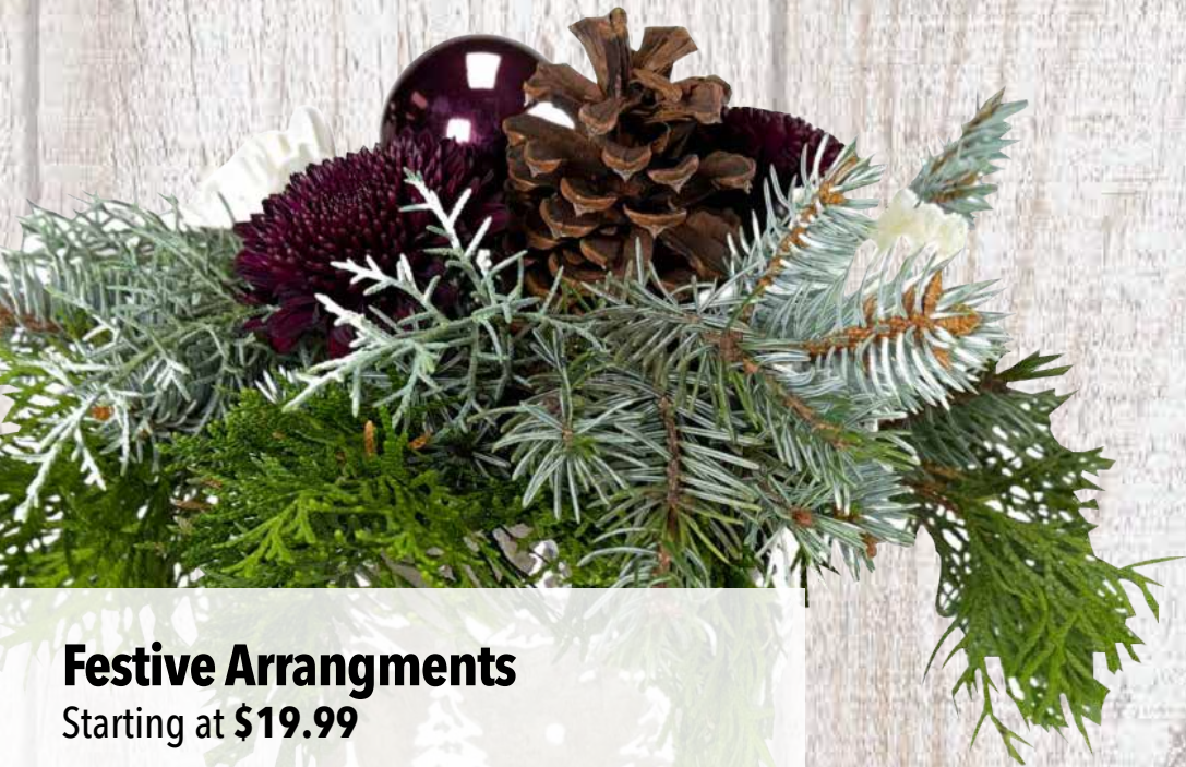
Festive Arrangments Starting at $19.99