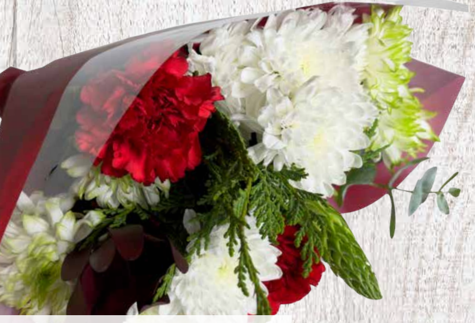
Farm Boy™ Holiday Bouquets Starting at $14.99