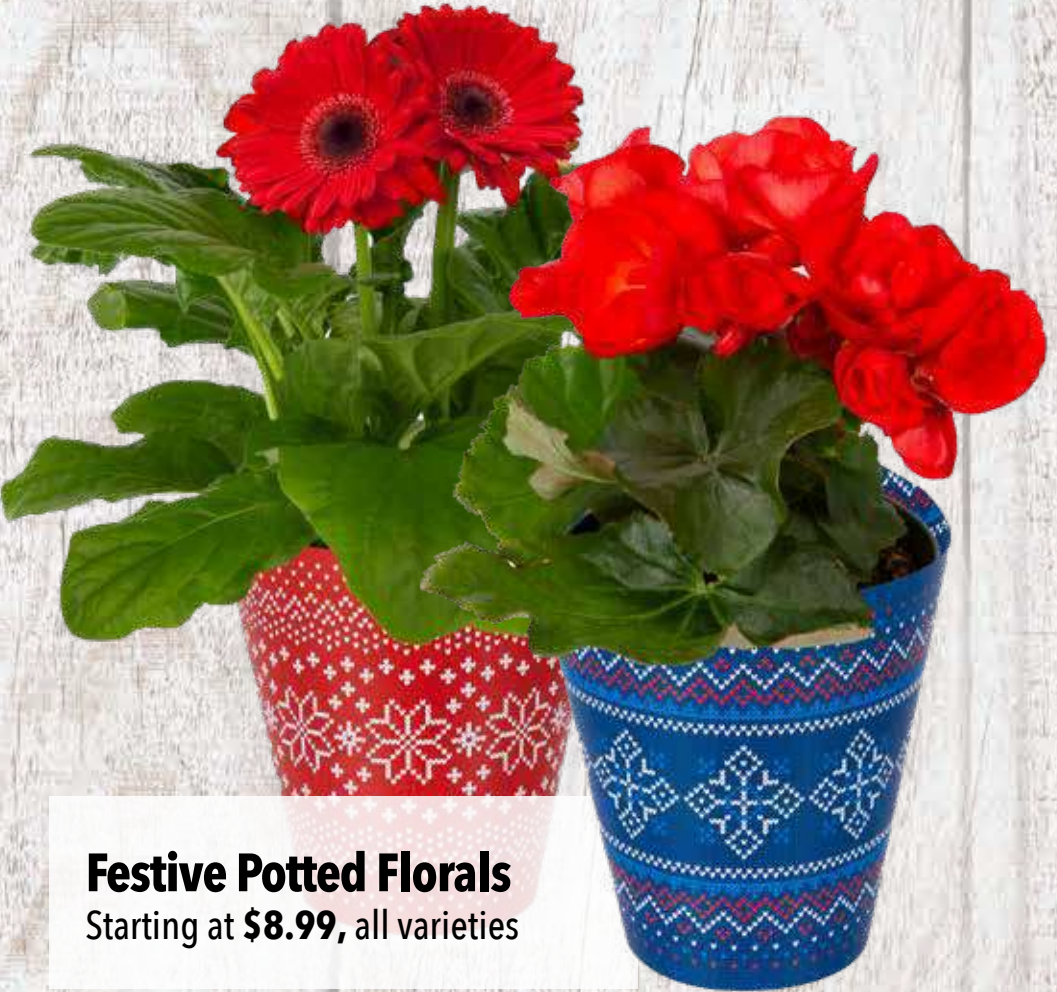
Festive Potted Florals Starting at $8.99, all varieties