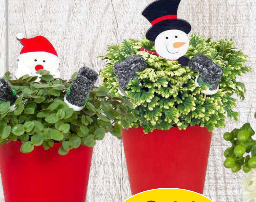
Premium Foliage with Santa